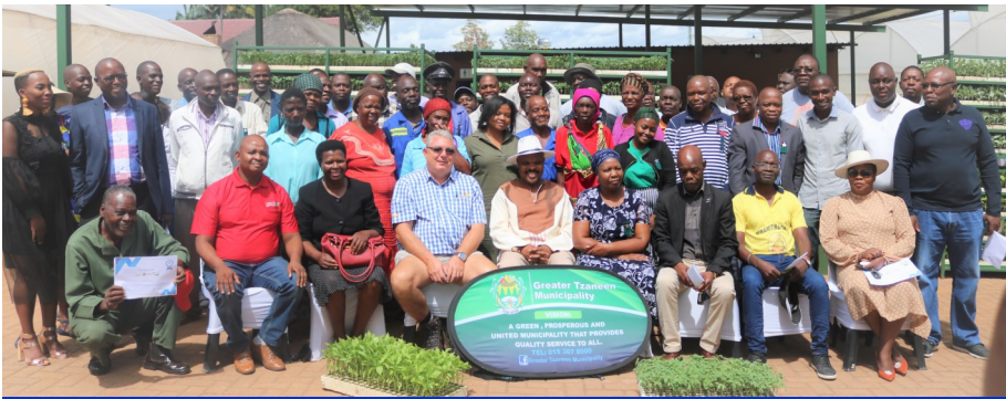
Mayor Maripe Mangena with fellow councillors and beneficiaries.