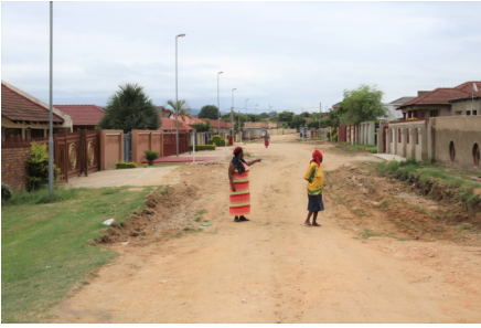
Codesa Street in Nkowankowa Section B is getting an upgrade