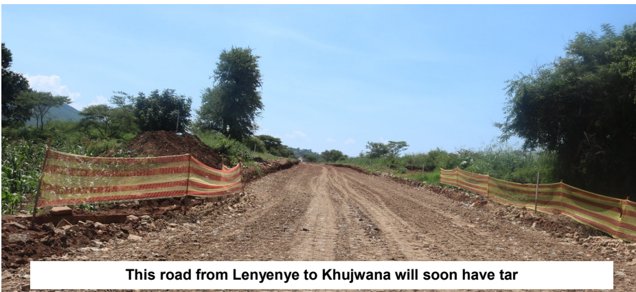
This road from Lenyenye to Khujwana will soon have tar