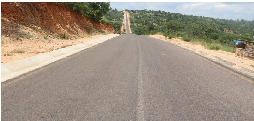
The 12 km road from Manswi to Kheshokolwe

The project to upgrade the D1350 between the village of Moruji and Maswi from gravel to tar is nearing its completion.