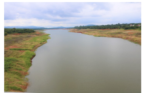
A view of Tzaneen Dam