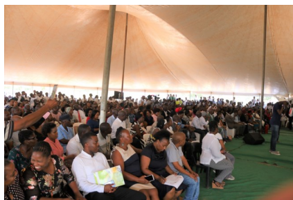
Residents and Stakeholders came in numbers to witness the unveiling of the projects.