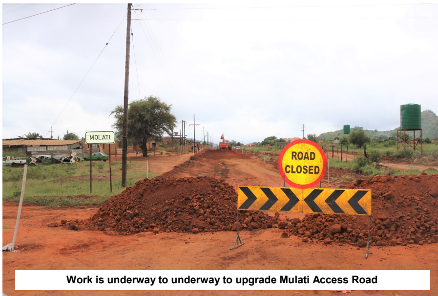
Work is underway to upgrade Mulati Access Road