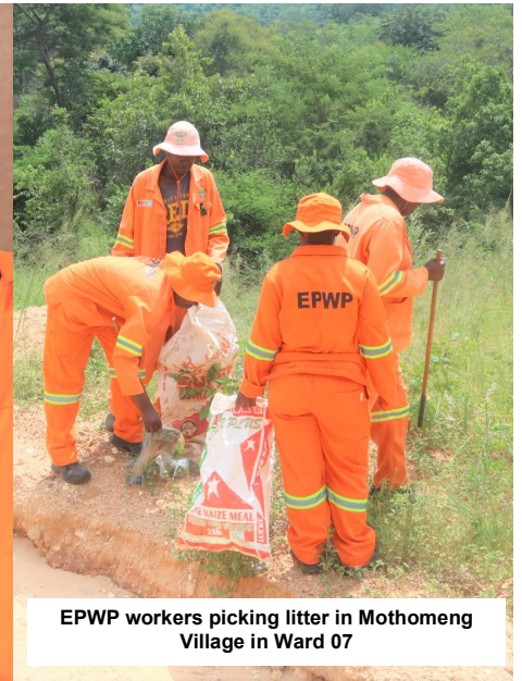
EPWP workers picking litter in Mothomeng Village in Ward 07

The Greater Tzaneen Municipality has rescued over 1000 of its residents from unemployment through its Extended Public Works Programme (EPWP).