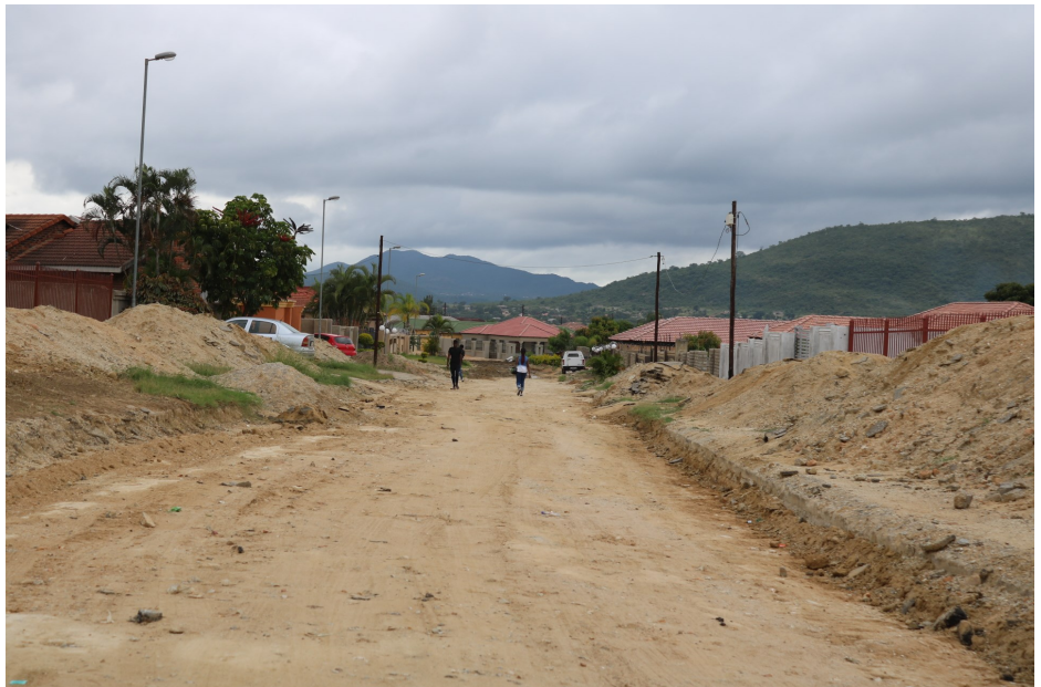
Construction work underway on the street that serves as boundary between Nkowankowa B and Nkowankowa D (Mbambamencisi)

Malunda says taxis do not come to “our side” so it is a struggle for us as com-