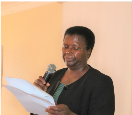
Acting Mayor Cllr Sannie Tiba