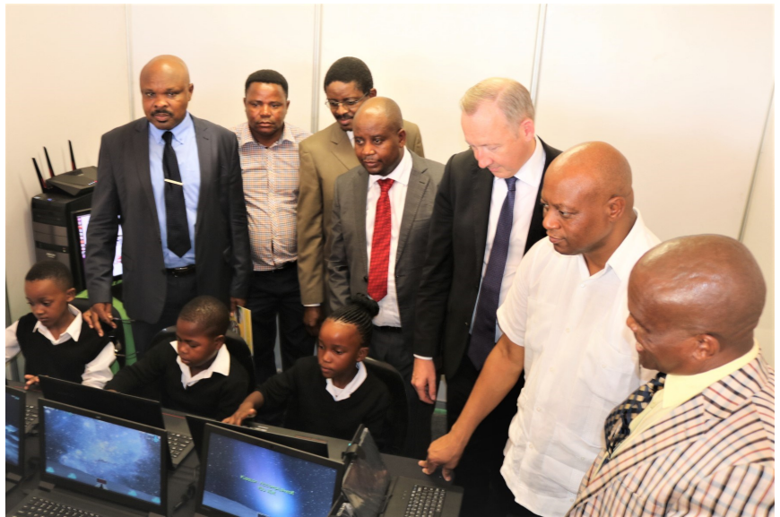
The delegation led by the Acting Premier Seaparo Sekoati visiting the project on the Offline Content to schools without Internet connectivity. With him MEC Biskopo Makamu (Agriculture and Rural Development), Mayor Mangena, Belgian Ambassador to South Africa, Didier Vanderhasselt and government officials.

The five projects will benefit the arts and culture sector, the education sector, the agricultural sector, the construction sector, and the environmental sector.