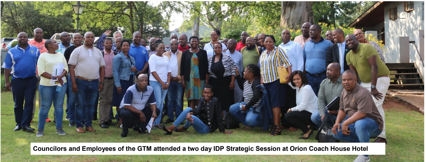
Councillors and Employees of the GTM attended a two day IDP Strategic Session at Orion Coach House Hotel